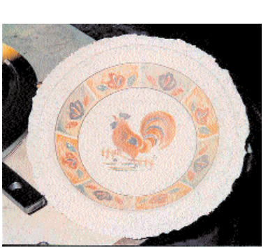
Fig. 3 a, b Decorated pressed plate and fired finished plate

The REVERSE-STO Technology also enables a 45 % reduction in production costs, depending on the different methods of production. It permits a substantial reduction in energy costs as the system eliminates one or two kilns: this is a major benefit both in economic and ecological terms. The excellent cooperation